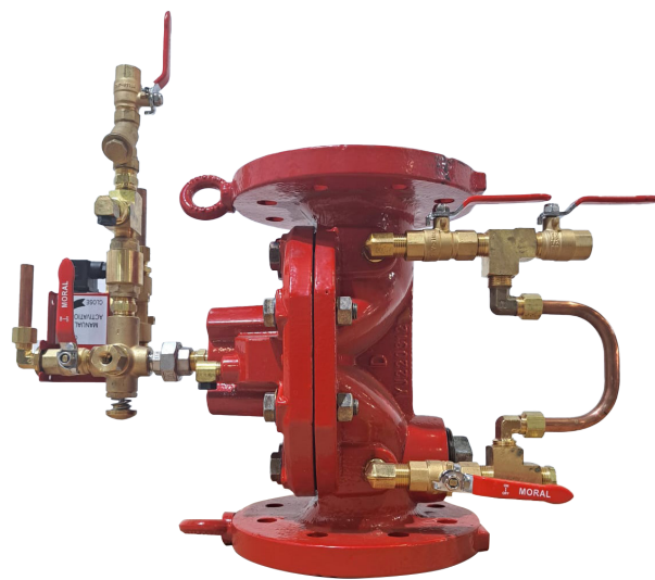
Valve adaptation to limited dimensions of the cabinet