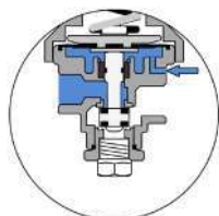
Pressurized Sensor Line / Command