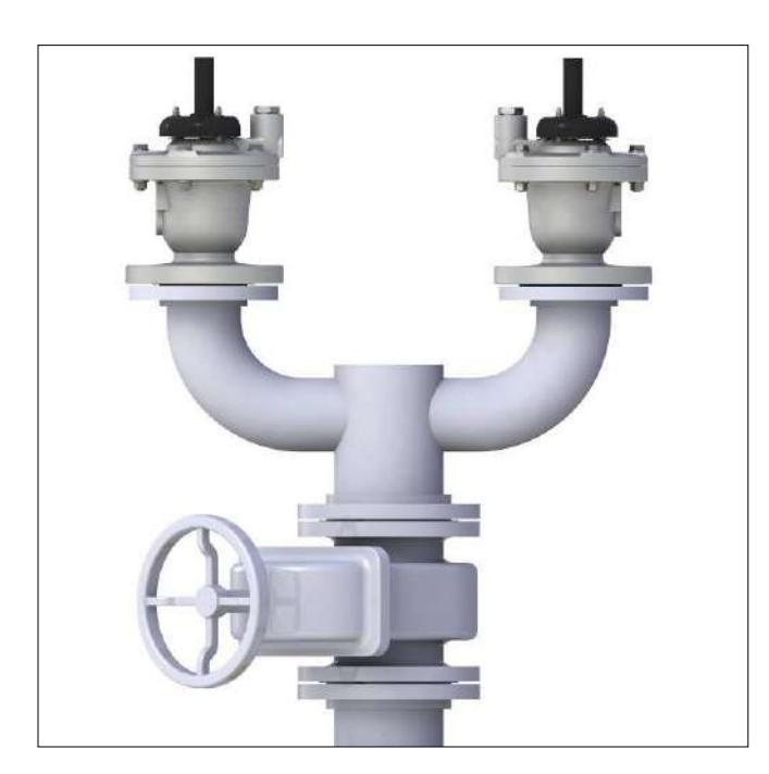
Two Vacuum Breakers on a shared Isolating Valve. The outlets face outward and the Isolating Valve at 45° to Air Valve outlets