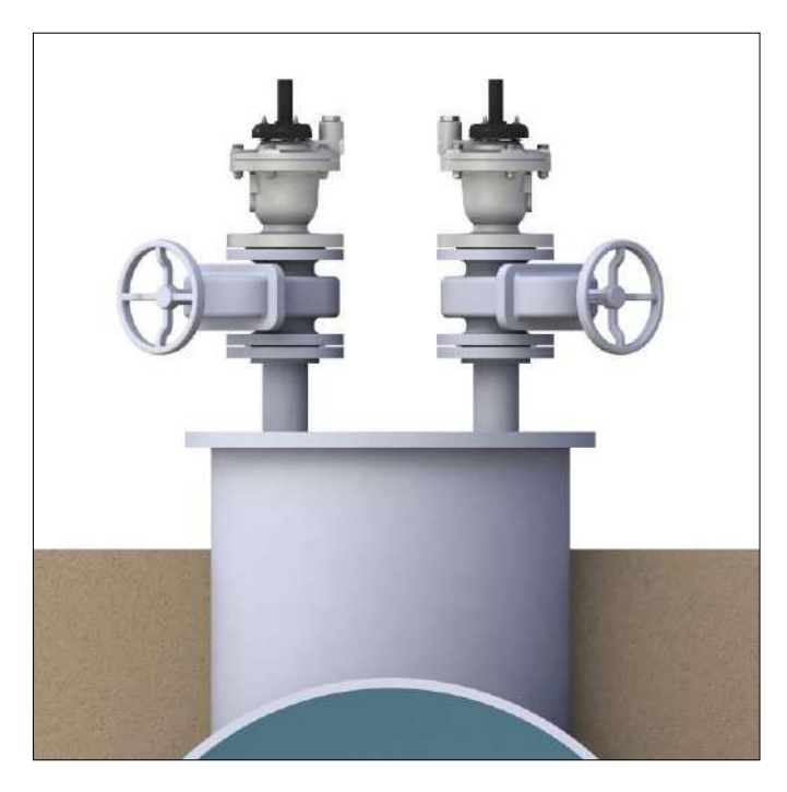
Two Vacuum Breakers on an Air Trap with separate Isolating Valves. The outlets face outward and the Isolating Valves at 45° to Air Valve outlets